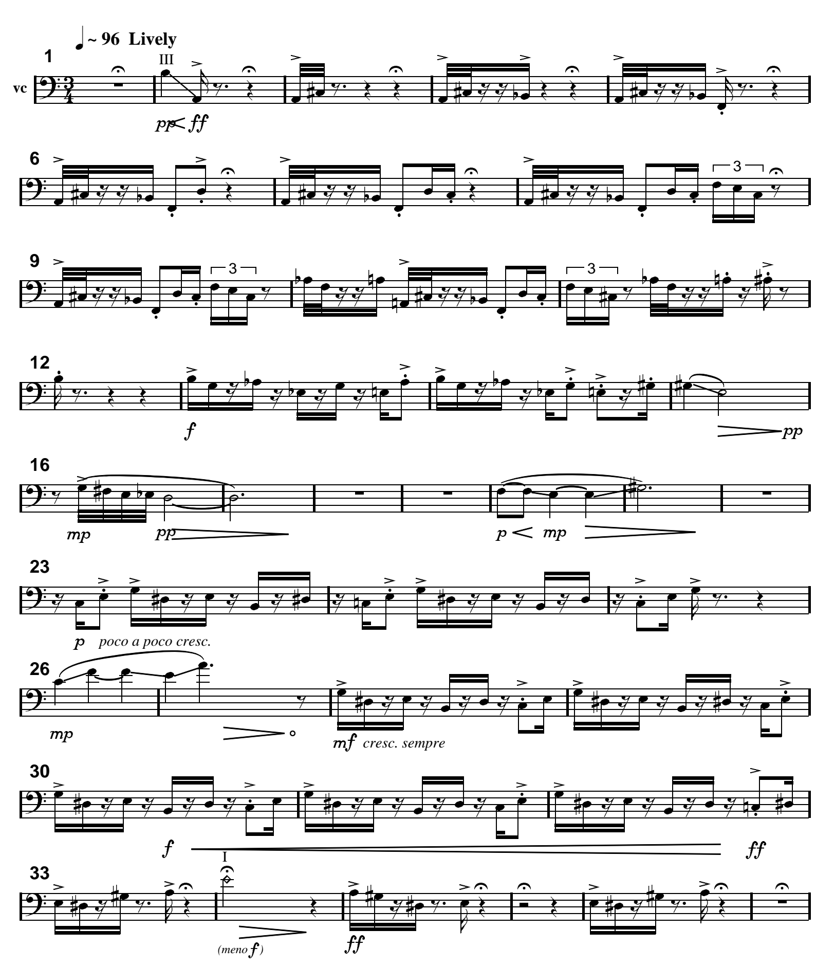
Jukka Tiensuu 2012